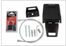
Security Bracket Accessory Kit 97-735

Up to 47% smaller and lighter than competitive offerings