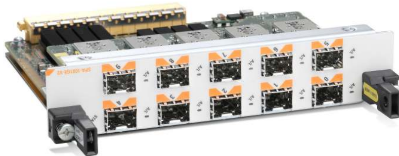
Figure 1. Cisco 10-Port Gigabit Ethernet SPA

The Cisco® Interface Flexibility (I-Flex) design combines shared port adapters (SPAs) and SPA interface processors (SIPs), taking advantage of an extensible design that helps enable service prioritization for voice, video, and data services. Enterprise and service provider customers can take advantage of improved slot economics resulting from modular port adapters that are interchangeable across Cisco routing platforms. The Cisco I-Flex design maximizes connectivity options and offers superior service intelligence through programmable interface processors that deliver line-rate performance. Cisco I-Flex enhances speed-to-service revenue and provides a rich set of quality of service (QoS) features for premium service delivery while effectively reducing the overall cost of ownership. This data sheet contains the specifications for the Cisco 2-, 5-, 8-, and 10-Port Gigabit Ethernet Shared Port Adapters, Version 2 (Figures 1, 2, and 3).