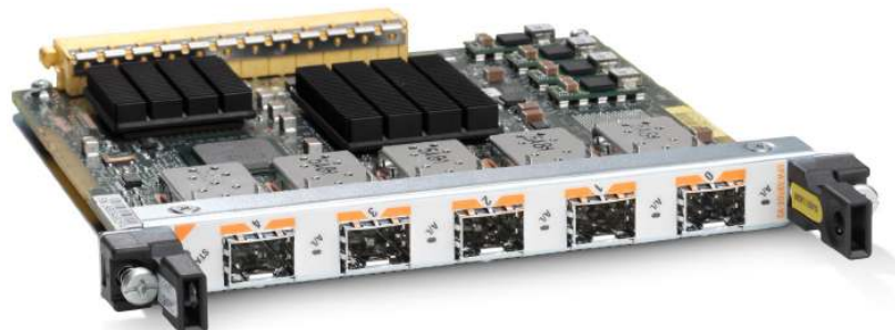
Figure 2. Cisco 5-Port Gigabit Ethernet SPA

The Cisco 2-, 5-, 8-, and 10-Port Gigabit Ethernet SPAs are available on high-end Cisco routing platforms, offering the benefits of network scalability with lower initial costs and ease of upgrades. The Cisco SPA/SIP portfolio continues the company's focus on investment protection along with consistent feature support, broad interface availability, and the latest technology. The Cisco SPA/SIP portfolio allows deployment of different interfaces (Packet over SONET/SDH [PoS], ATM, Ethernet, etc.) on the same interface processor.