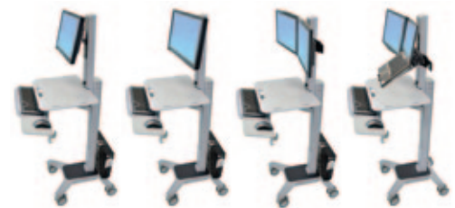
LCD Mount, LD 24-198-055 LCD Mount, HD 24-197-055 Dual 24-196-055 Combo 24-195-055

© 2010 Ergotron, Inc. rev. 07/07/2010 870-05-096-EA Content is subject to change without notification