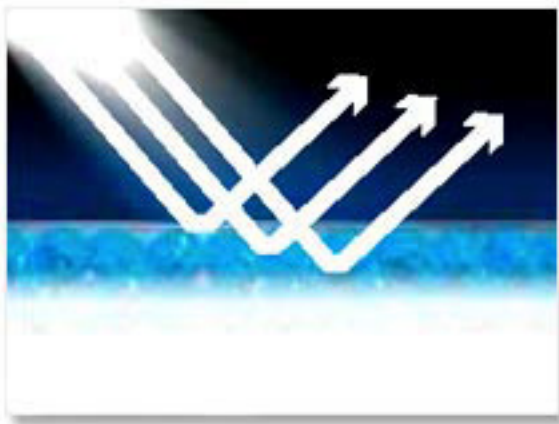
Epson's UltraChrome K3 Ink

Introducing a major breakthrough in ink development, the STYLUS PHOTO R2400 features the new Epson UltraChrome K3 pigment ink set. Based on a newly developed pigment ink formulation and incorporated in all eight cartridges - Cyan, Magenta, Yellow, Light Cyan, Light Magenta, Matte Black (or Photo Black), Light Black and now a Light, Light Black - the new formulation delivers an increased colour space covering nearly the entire gamut.