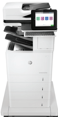
HP LaserJet Enterprise Flow MFP M632z