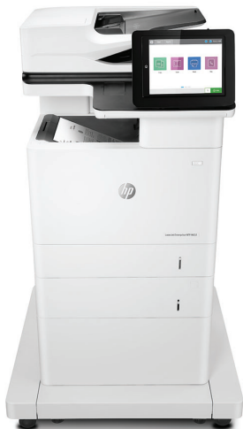
HP LaserJet Enterprise MFP M632ft