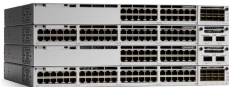
Figure 1. Cisco Catalyst 9300 Series Switches

Table 1 lists port scale and power details for the Cisco Catalyst 9300 Series models.