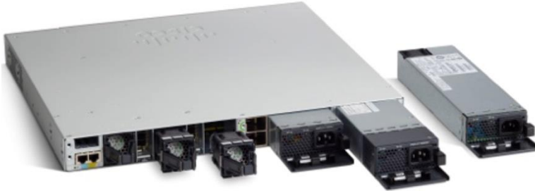
Figure 3. Cisco Catalyst 9300 Series Dual Redundant Power Supplies

Table 3 lists the different power supplies available in these switches and available PoE power.