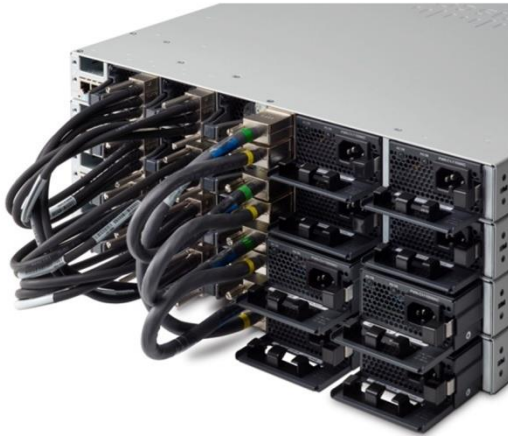
Figure 4. Cisco Catalyst 9300 Series StackPower

add one extra power supply in any switch of the stack and either provide power redundancy for any of the stack members or simply add more power to the shared pool.