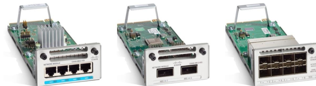
Table 2. Network Module Numbers and Descriptions